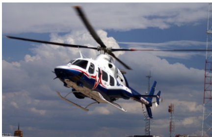
AirLIFE's Bell 430

With an average cruise speed of 140 knots, this aircraft is 20% faster than our previous aircraft, which reduces our flight time to common destinations such as Del Rio and Laredo from 60 minutes to 48 minutes. This means that the patient will arrive to the tertiary care facilities faster.